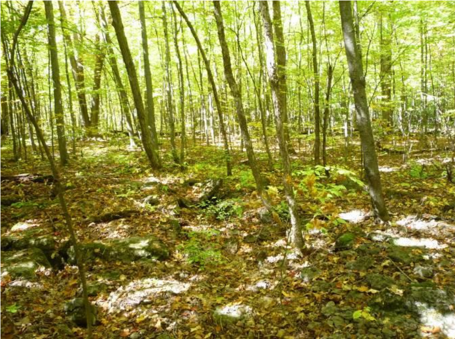
Photo 5 & 6: Sugar maple/ash woodlot (Photo date: September 25 th , 2013).