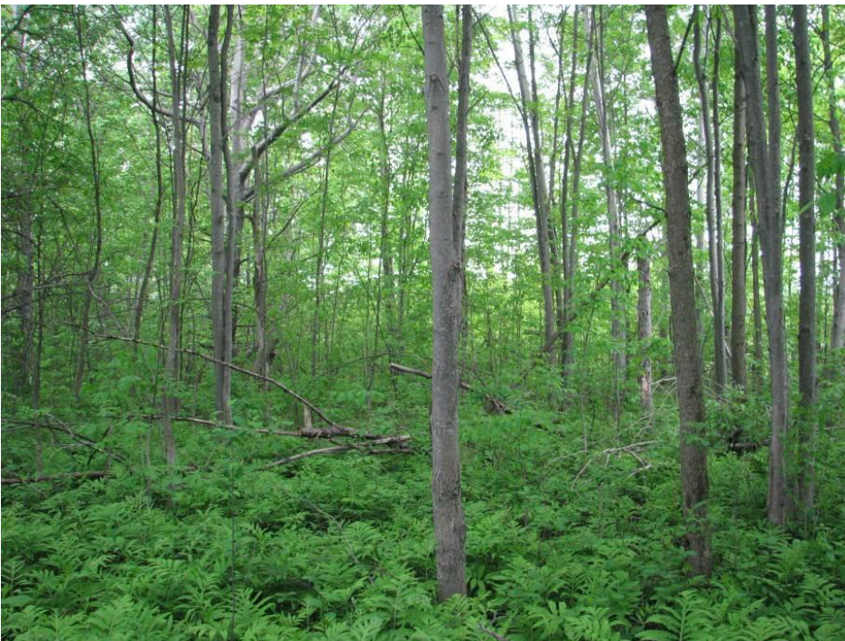
Photo 18: Sugar Maple, Ironwood Forest (Photo date: May 29 th , 2014).

This community was identified on the south-western borders of the study area and was approximately 2.3 ha in size. This community was identified as the Navan Road at Pagé Road UNA #97 and was designated under the City of Ottawa Official Plan as an Urban Natural Feature. The remnants are located adjacent to the stormwater pond and are part of the stormwater block. Tree dbh ranged from 11-34 cm dbh. This community used to be a lot larger based on the boundary Evaluated in 2003. Now a long narrow remnant of the forest this community was dominated by mature sugar maple and ironwood. Shrub and herbaceous species identified in the understory included common juniper ( Juniperus communis ), prickly gooseberry ( Ribes cynosbati ), skunk currant ( Ribes glandulosum ), smooth gooseberry ( Ribes hirtellum ) and red currant ( Ribes rubrum ). Ground species included shinleaf ( Pyrola elliptica ), indian pipe ( Monotropa uniflora ), starflower ( Trientalis borealis ), ditch stonecrop ( Penthorum sedoides ) and foam flower ( Tiarella cordifolia ).