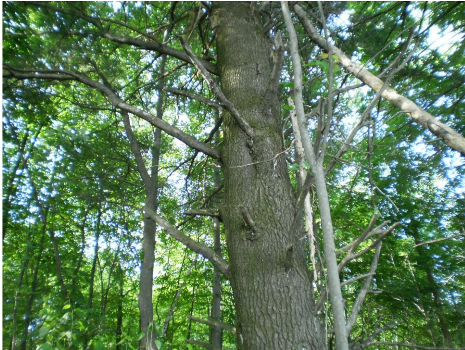
Photo 8 – Mature white pine in the northeast portion of the site (June 20 th , 2018)