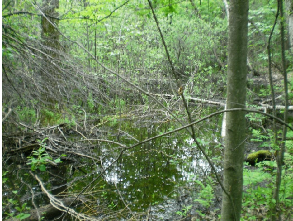
Photo 2 – Standing water in another excavation area. This example is in the south-central portion of the site (May 27 th , 2018)