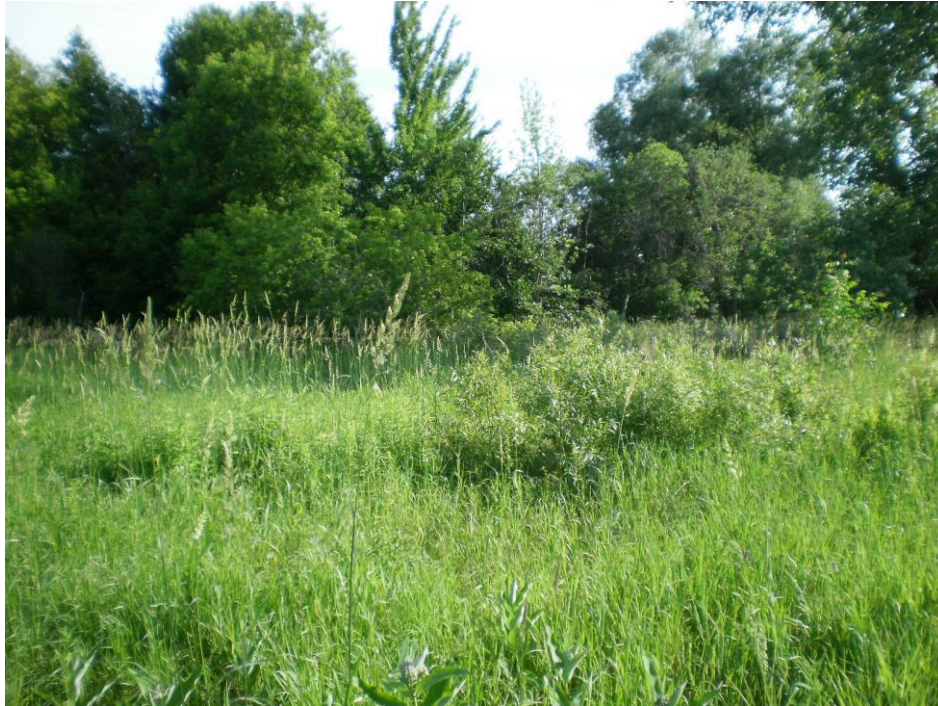
Photo 14 - Cultural meadow in the southeast corner of the site north of Navan Road. View looking north to the southeast edge of maple swamp (June 20 th , 2018)