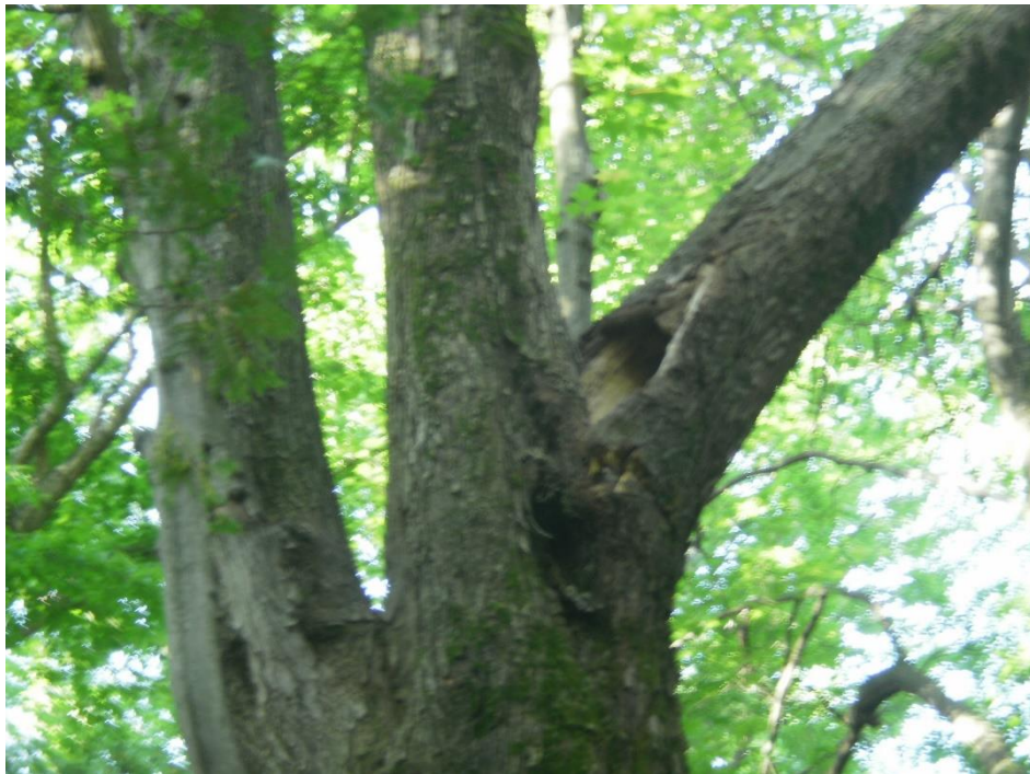
Photo 13 – Red maple with potential wildlife cavity in the northeast portion of the site (June 20 th , 2018)