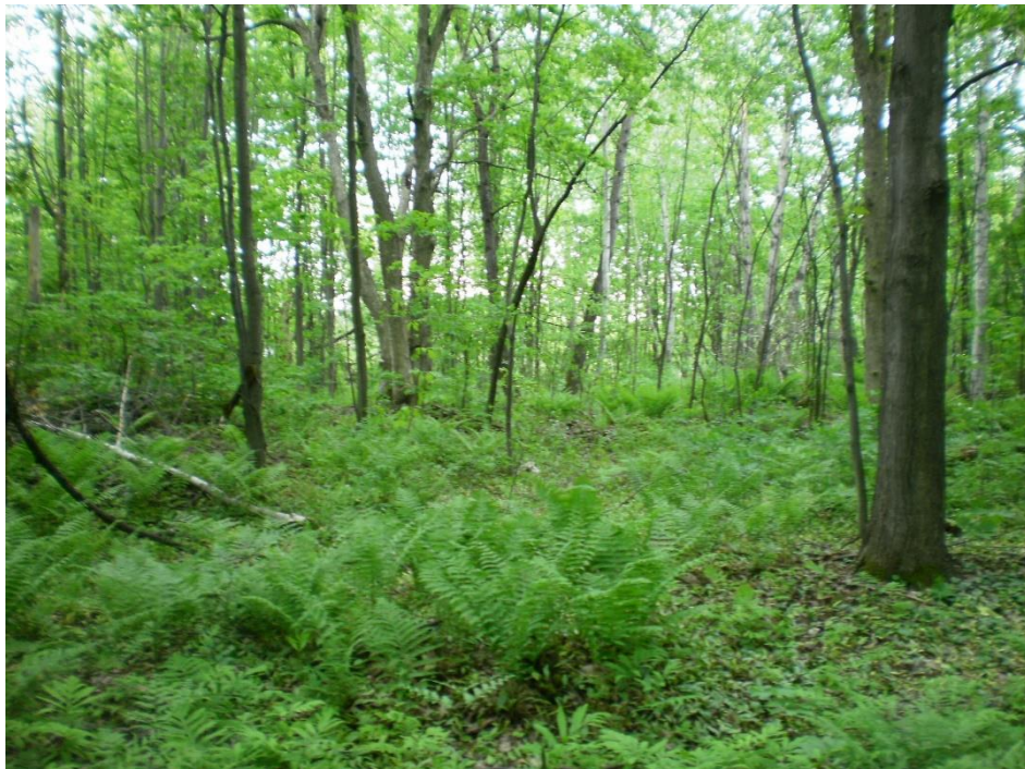
Photo 5 – Red maple swamp in the central-east portion of the site (May 27 th , 2018)