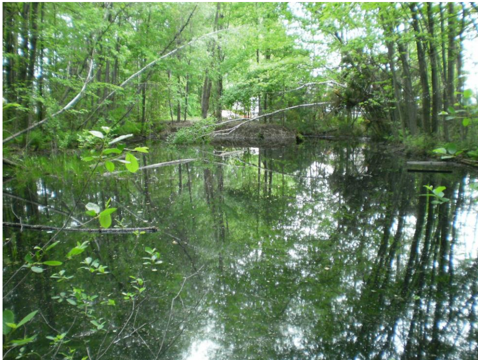
Photo 1 – One of the larger areas of standing water. This example is in the northeast portion of the site (May 27 th , 2018).

The site has become more isolated as the adjacent portions of south Orleans are converted to urban residential development, including construction of Brian Coburn Boulevard and many urban subdivisions. The lands between the site and Mer Bleue are now dominated by urban residences, providing no wildlife linkage to the extensive natural areas of Mer Bleue. Thus, the site is not anticipated to perform a significant linkage function.