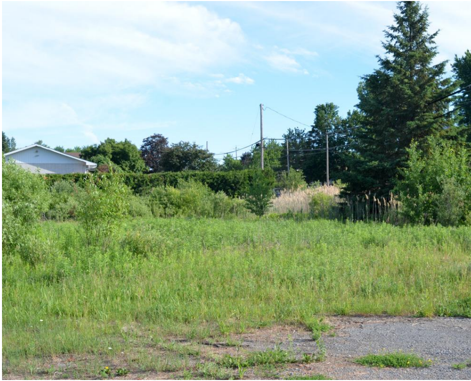
Photo 16 – Cultural meadow in the expanded site area in the southeast corner of the site. View looking north from north edge of gravel fill (June 10 th , 2021)