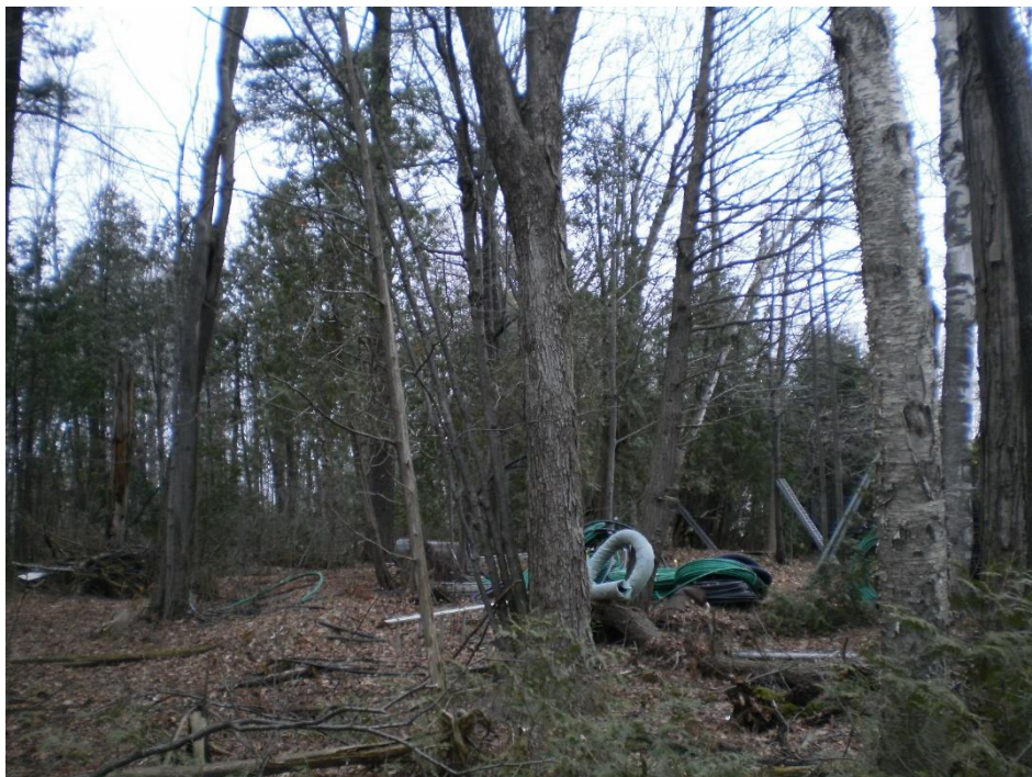
Photo 7 – Larger trees were more common in the northeast portion of the site. Debris was also common in this area (December 4 th , 2017)