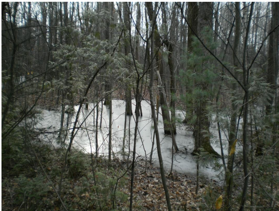
Photo 3 – Another low area from former extraction activity. This example is in the west portion of the site (December 4 th , 2017)