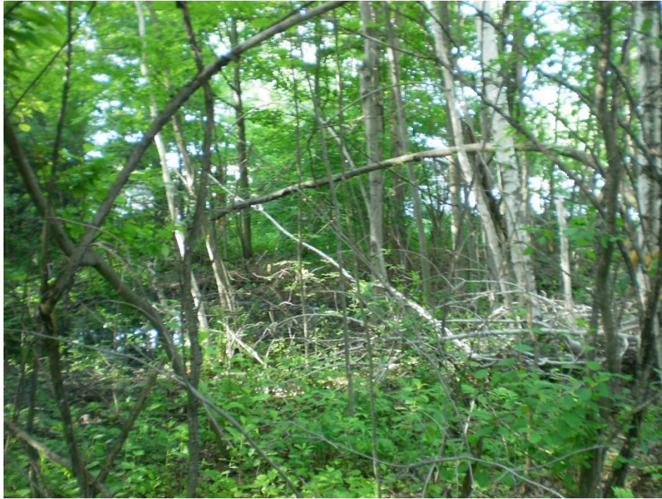
Photo 4 - Windthrow was common in the west portion of the site (June 20 th , 2018)