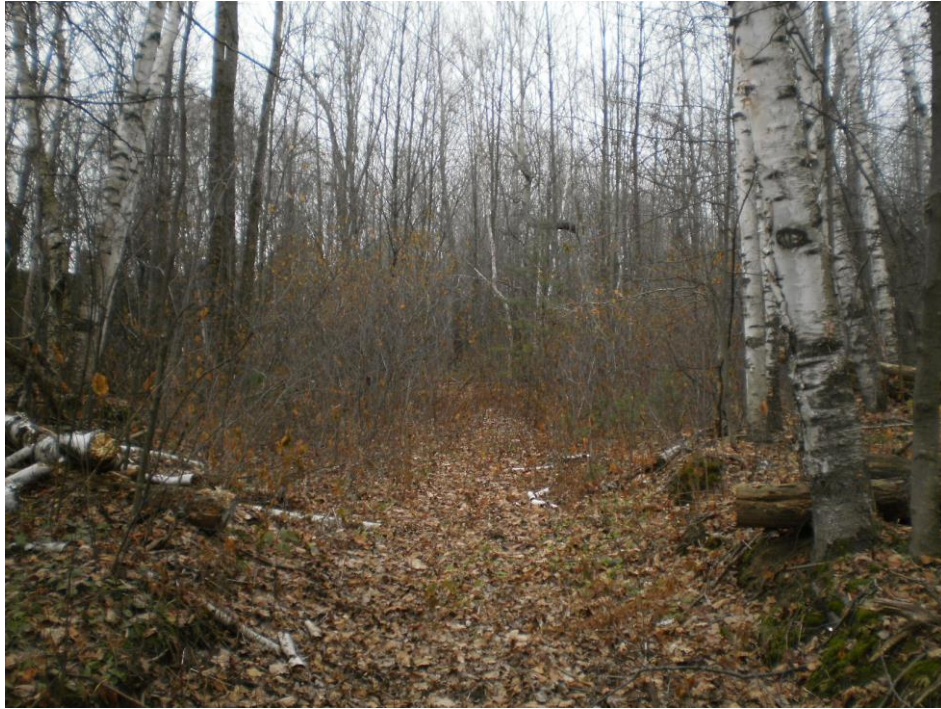
Photo 12 – Another access lane in the east portion of the site. View looking west (December 4 th , 2017)