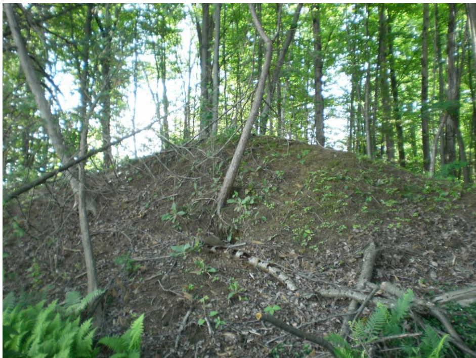
Photo 9 – Spoil piles from past sand extraction are common throughout the site. This example is in the northeast portion of the site (June 20 th , 2018)