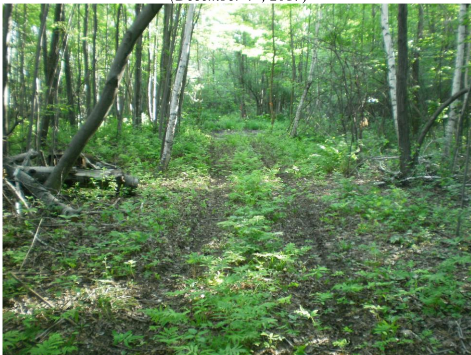
Photo 11 – Many access lanes are on the site. This example is in the southwest portion, with view looking west (June 20 th , 2018)