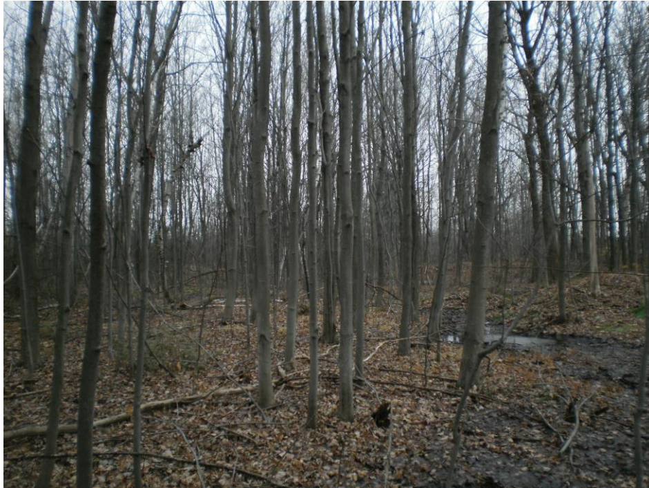
Photo 6 – Typical maple tree size, with white birch and trembling aspen present. This example is in the south-central portion of the site (December 4 th , 2017)