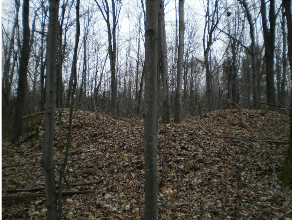
Photo 10 – Another example of the spoil piles, in the southeast portion of the site (December 4 th , 2017)