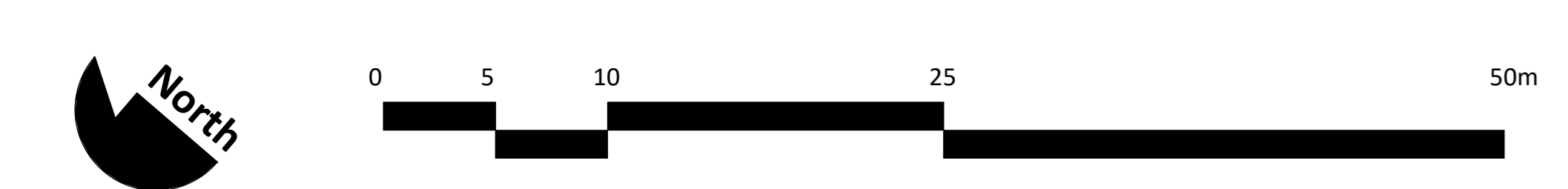
37 WILDPINE COURT - SITE PLAN 1:250

C:\Users\ppomerleau\Documents\21010_DEV-WILDPINE_CENTRAL_R01_ppomerleau\W453.rvt