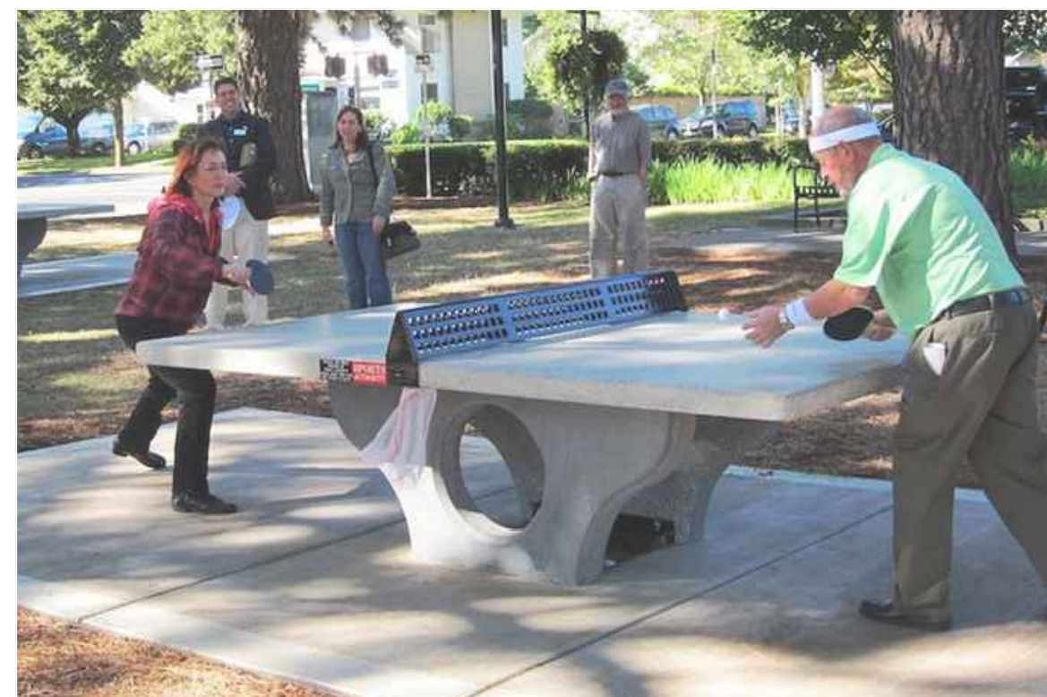
CONCRETE PING PONG TABLE