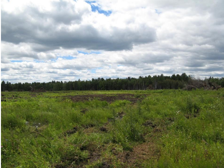
Photo 2 - Phase 1B-2 lands looking south from north end, with trees within the Carp Creek corridor, being Blocks 166 to 168 on registered Plan 4M-1593 in the background