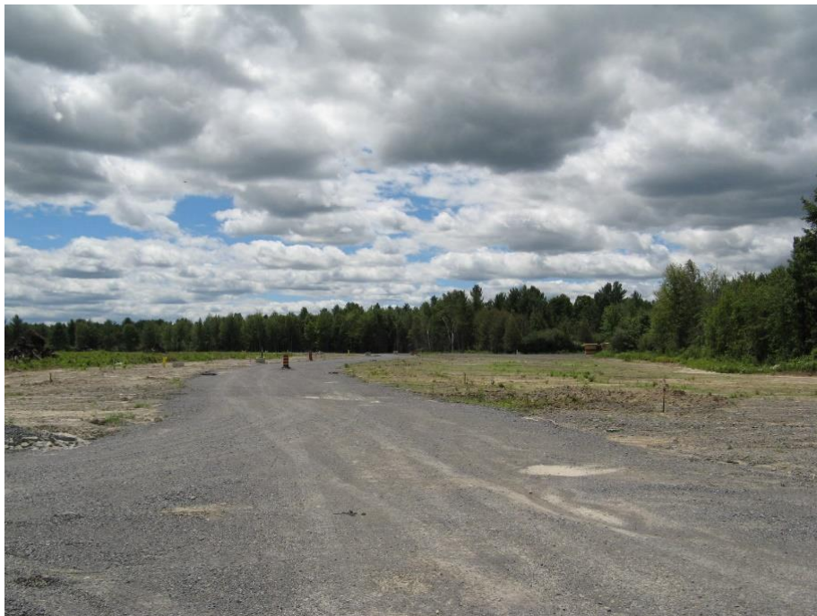
Photo 3 – Road base installed in Phase 1B-1 abutting the west portion of the Phase 1B-2 lands. View looking south from northwest end, with trees within the Carp Creek corridor, being Blocks 166 to 168 on registered Plan 4M 1593 to the right and in the background