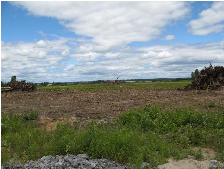
Photo 1 - Phase 1B-2 lands looking north from south end

Wildlife observed during the late June survey included ring-billed gull, song sparrow, black-capped chickadee, European starling, yellow warbler, American goldfinch, American crow, blue jay, American robin, red squirrel, and white-tailed deer tracks. No trees with potential wildlife cavities were observed on or adjacent to the Phase 1B-2 lands.