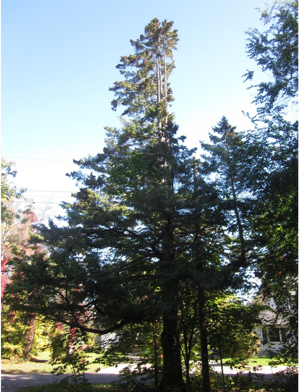
Picture 5. Tree #34, white spruce on City lands adjacent to 14 Crescent Road, Rockcliffe