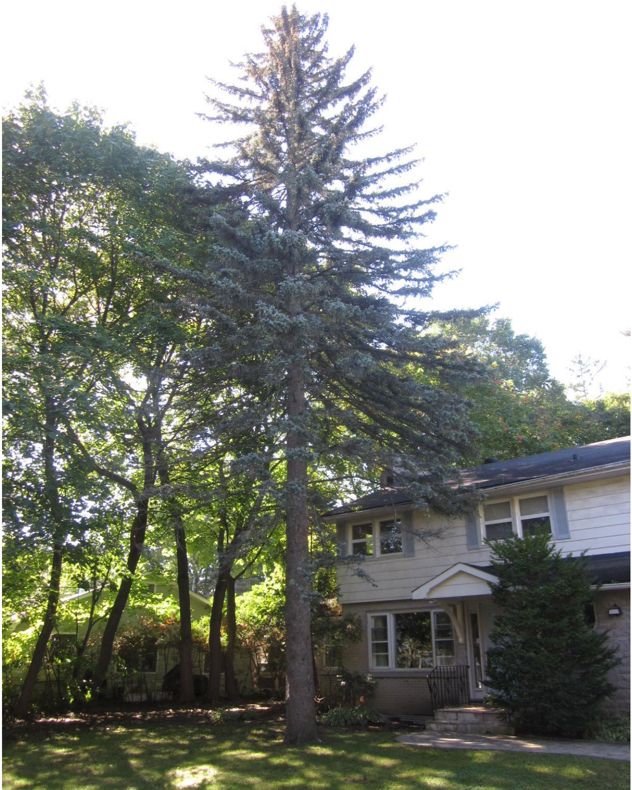
Picture 4. Tree #35, private Colorado spruce (foreground) and trees #23-28 (background right to left) at 14 Crescent Road, Rockcliffe