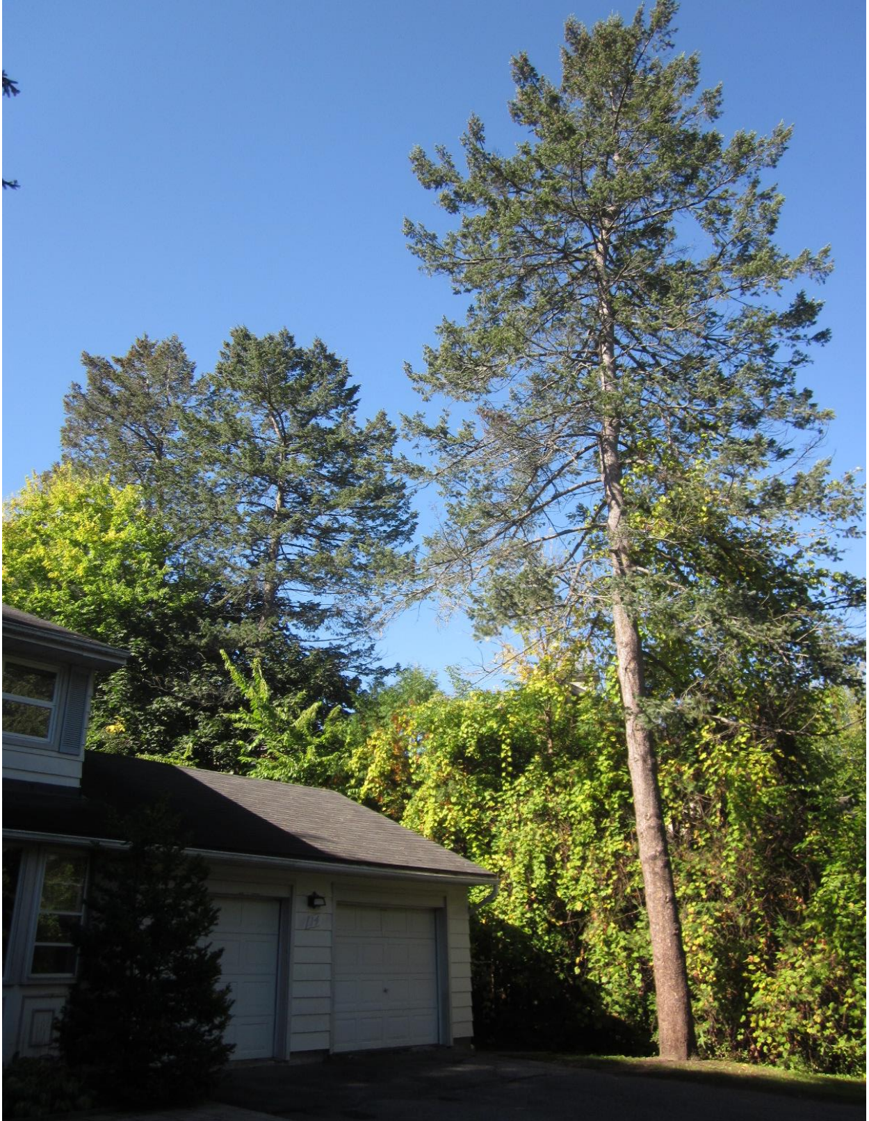
Picture 1. Private trees #2 and 3 (right) and upper crowns of 4, 6, 7 and 8 (left) at 14 Crescent Road, Rockcliffe