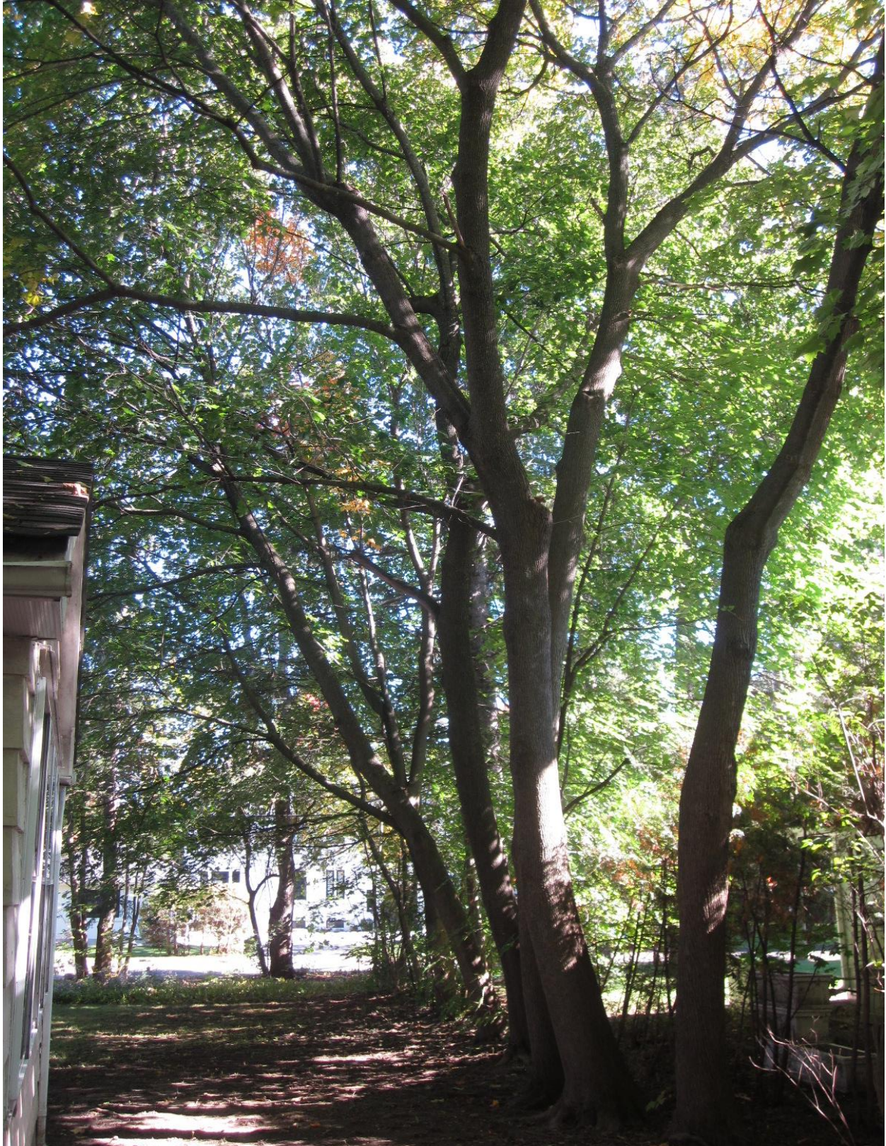
Picture 3. Trees #23-32 (foreground to background), on and adjacent to 14 Crescent Road, Rockcliffe