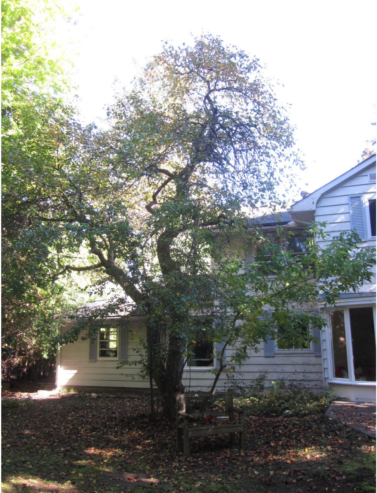
Picture 6. Tree #37, private crab apple at 14 Crescent Road, Rockcliffe