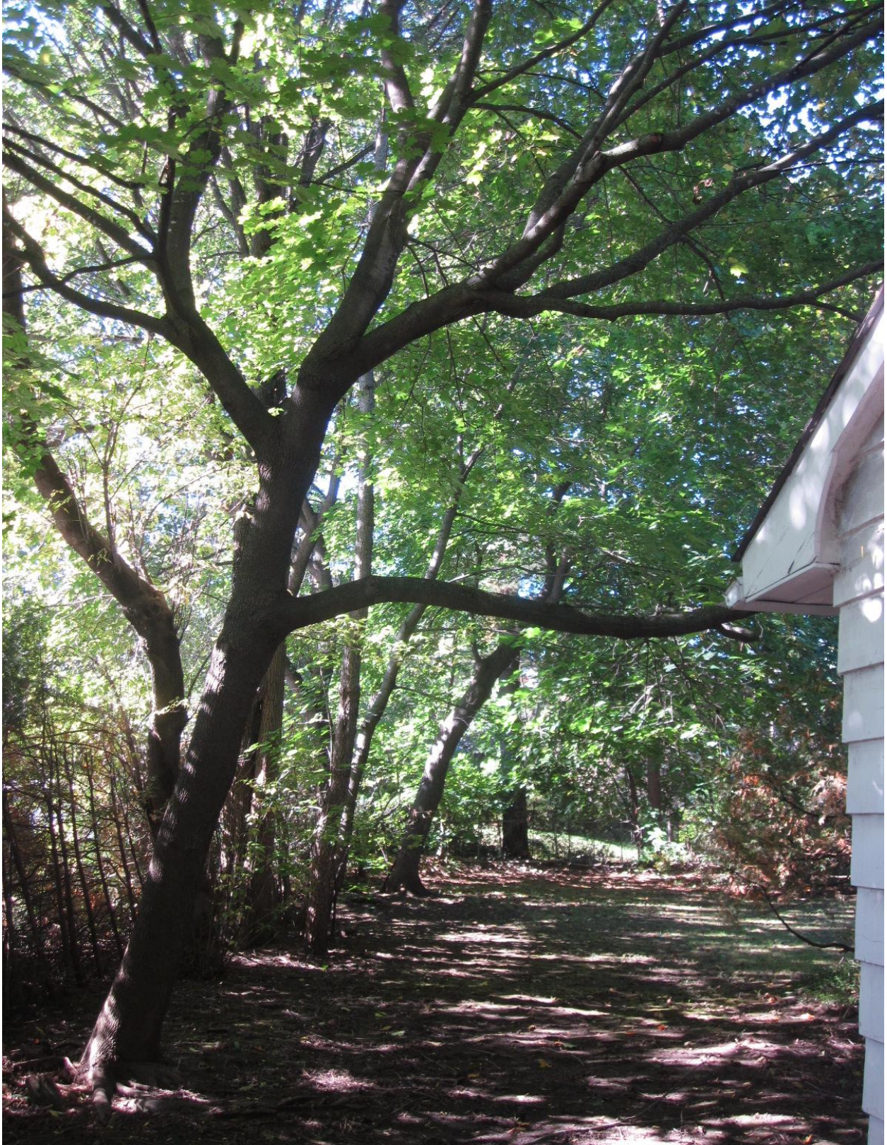
Picture 2. Trees #22 to 16 (foreground to background), on and adjacent to 14 Crescent Road, Rockcliffe