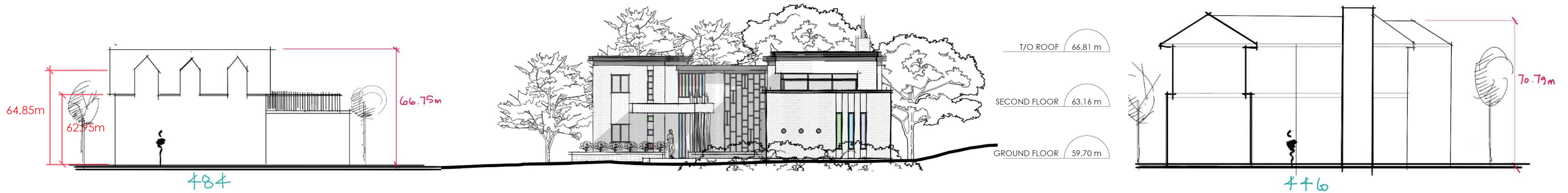
West side of Cloverdale Road depicted above. (South to North)