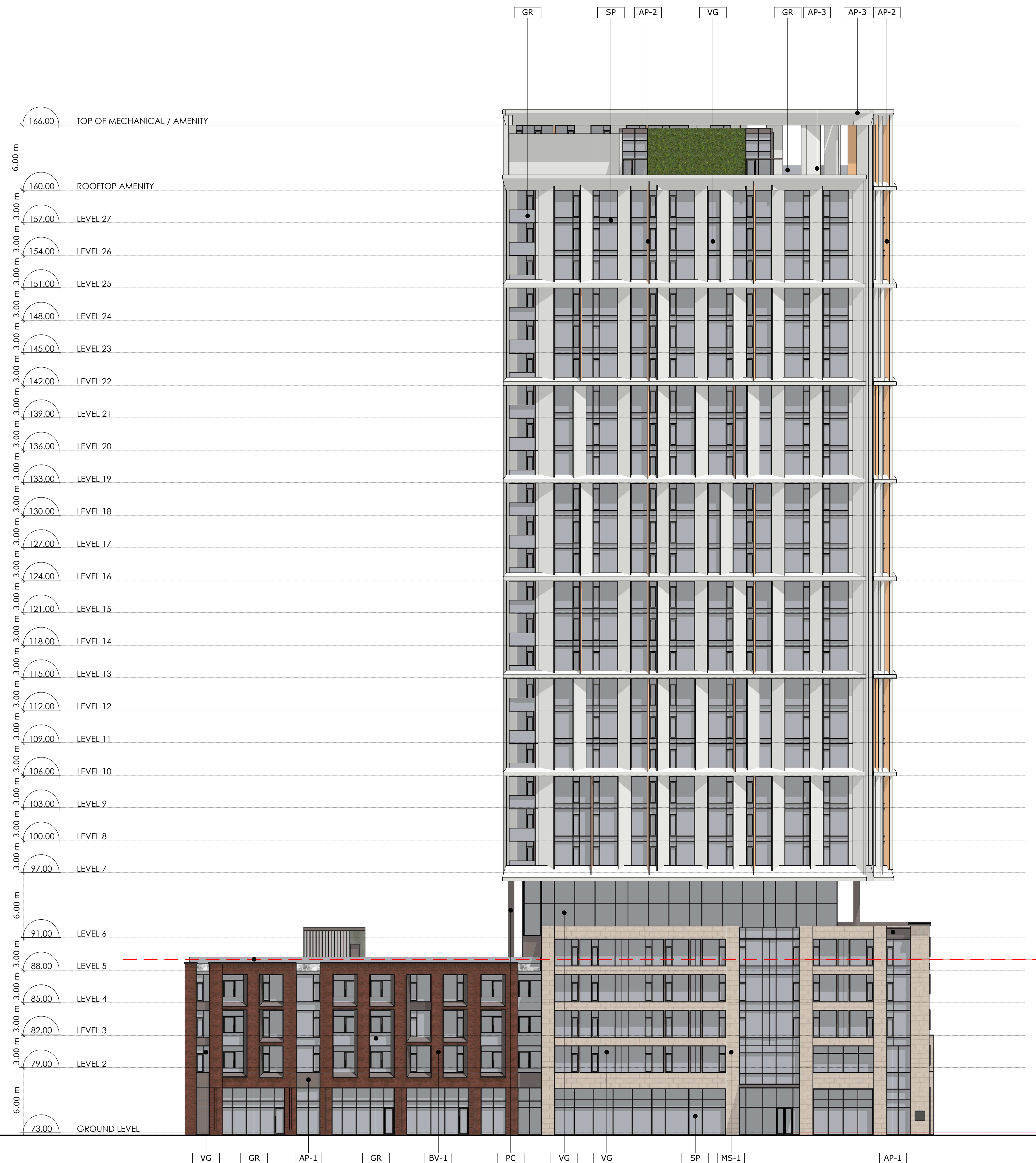
2 NORTH ELEVATION A3.01 Scale: 1: 200