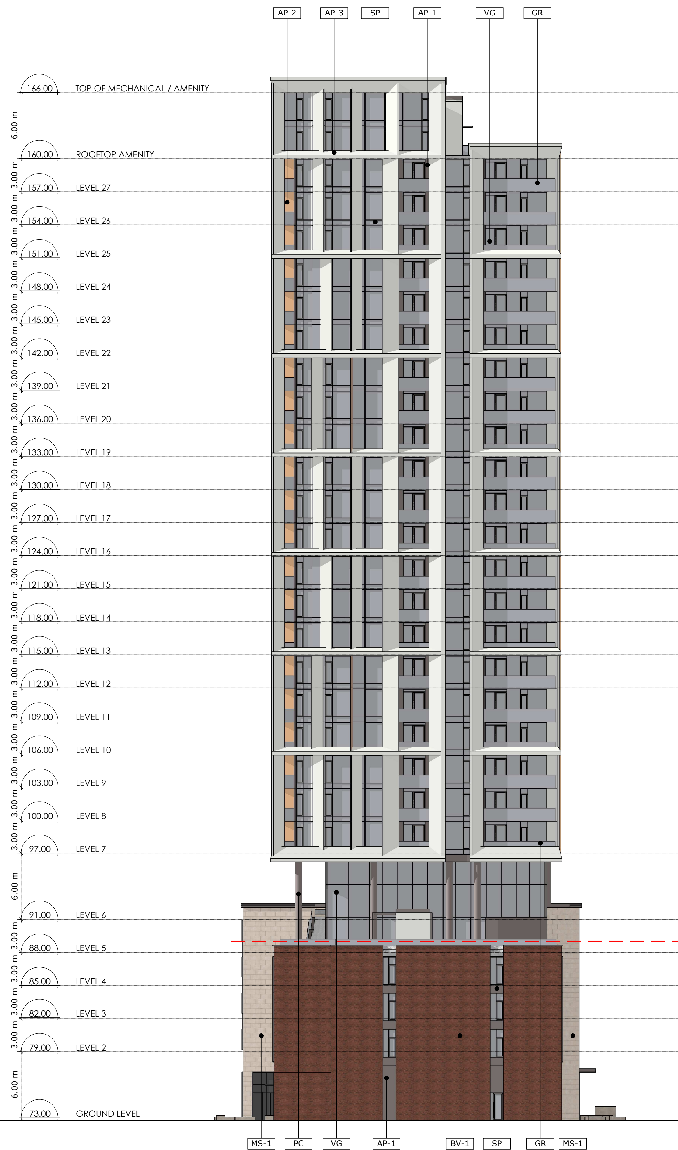
1 EAST ELEVATION A3.00 Scale: 1: 200