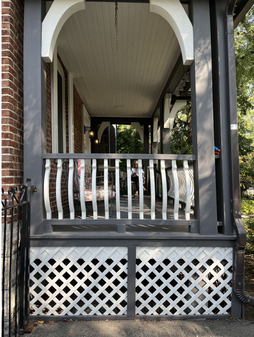
1 EXISTING FRONT PORCH CONDITION