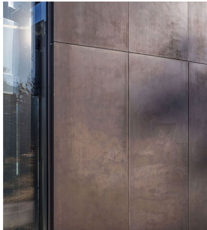
4 PROPOSED PATINAED BRONZE CLADDING