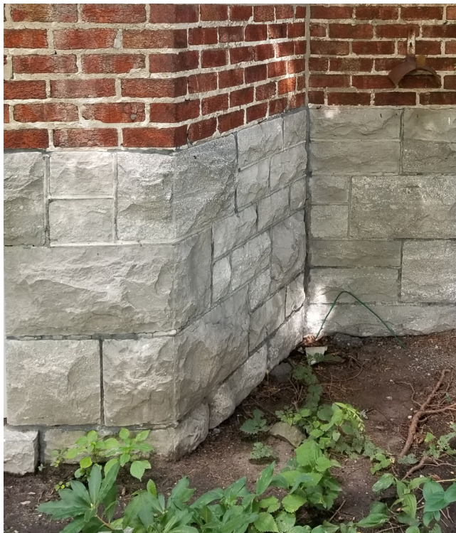
4 EXISTING STONE FOUNDATION & BRICK