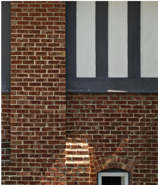
1 EXISTING HALF TIMBERING & BRICK