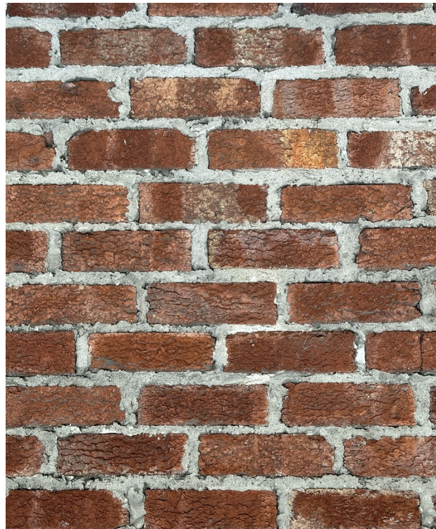
3 EXISTING BRICK