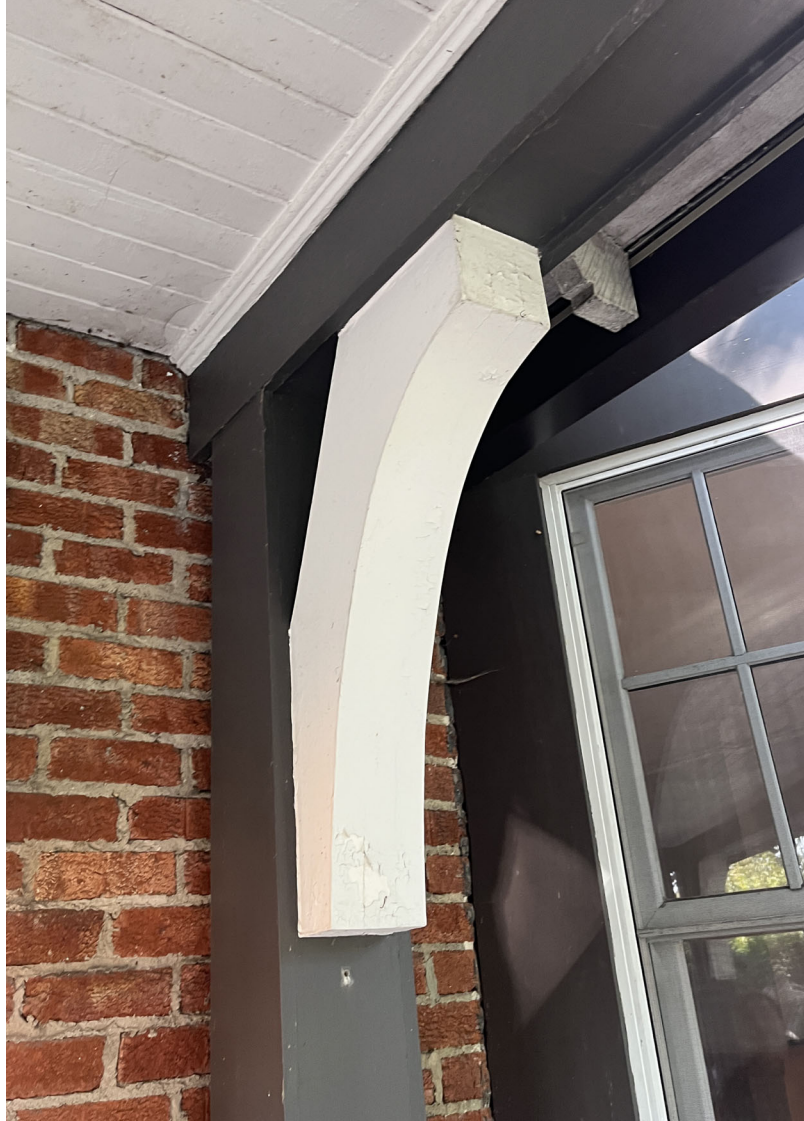
2 EXISTING PORCH DECORATIVE BRACKETS FOR REPLACEMENT