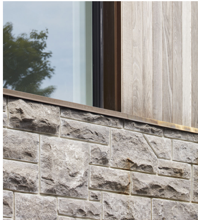
2 PROPOSED STONE, WOOD CLADDING, & BRONZE