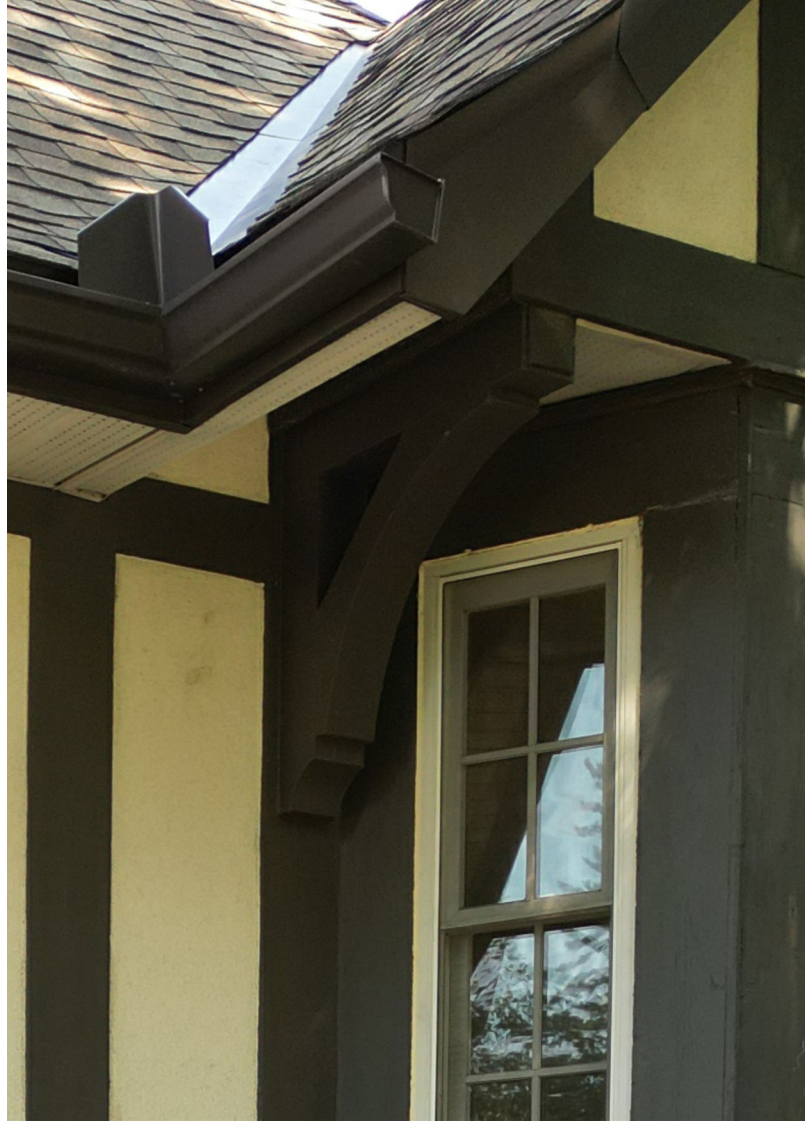
3 EXISTING BAY ORIGINAL BRACKETS - REINSTATE @ PORCH