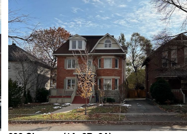
202 Clemow (1A, 2B, 3A)