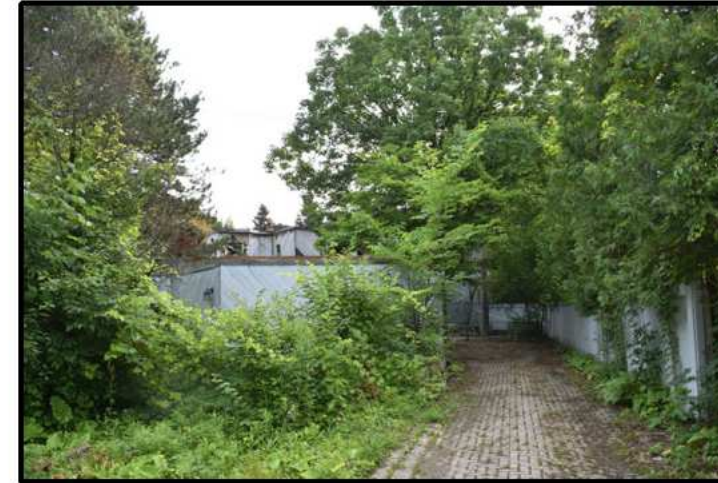
SUBJECT GARAGE - POST LOSS CONDITION SITE PHOTOGRAPH OBTAINED BY ROAR ENGINEER DATED JULY 8, 2024