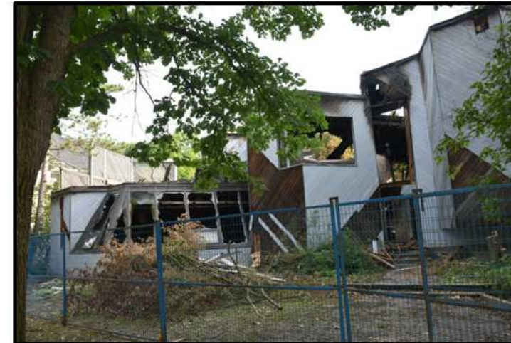
SUBJECT DWELLING - POST LOSS CONDITION SITE PHOTOGRAPH OBTAINED BY ROAR ENGINEER DATED JULY 8, 2024