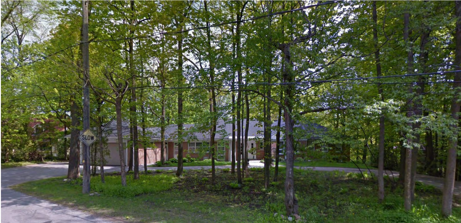
170 Lansdowne Road S - Grade I Heritage Property