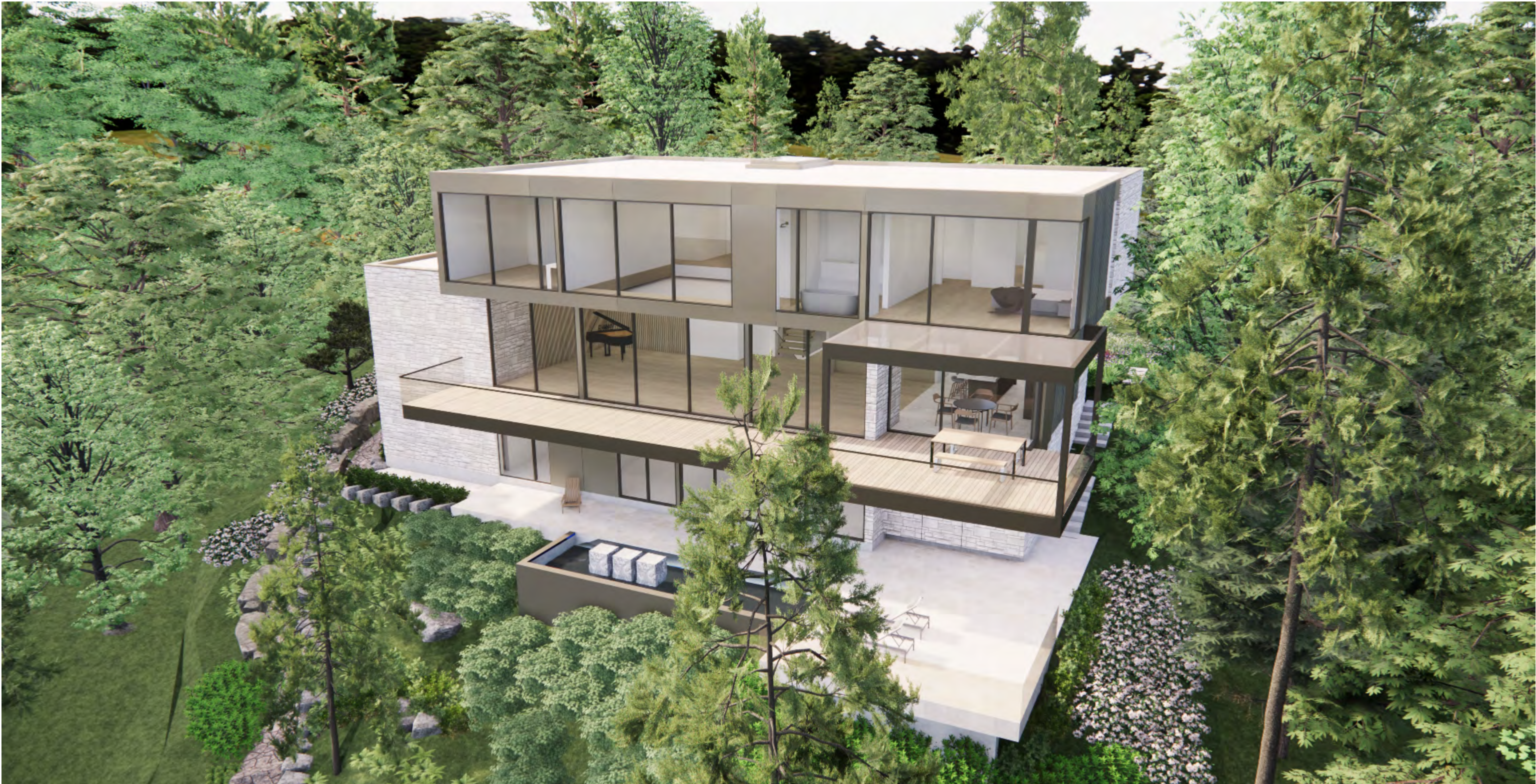
180 Lansdowne Road S - Proposed Design Rendering - Rear