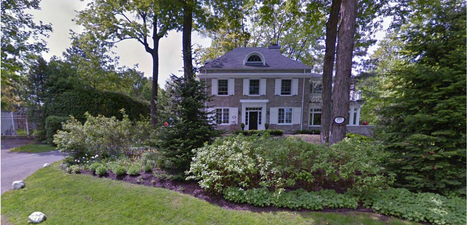
193 Lansdowne Road S - Grade I Heritage Property