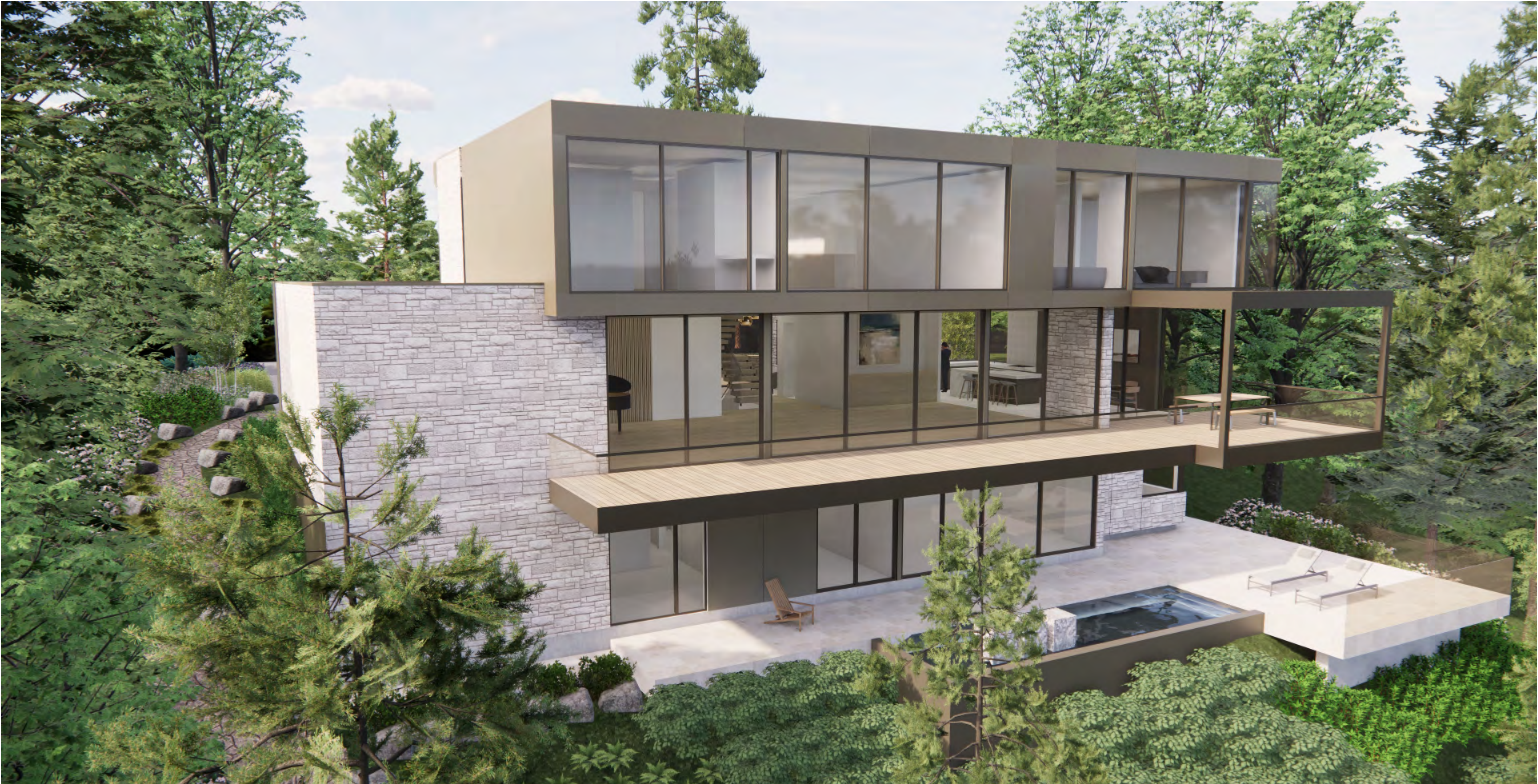
180 Lansdowne Road S - Proposed Design Rendering - Rear