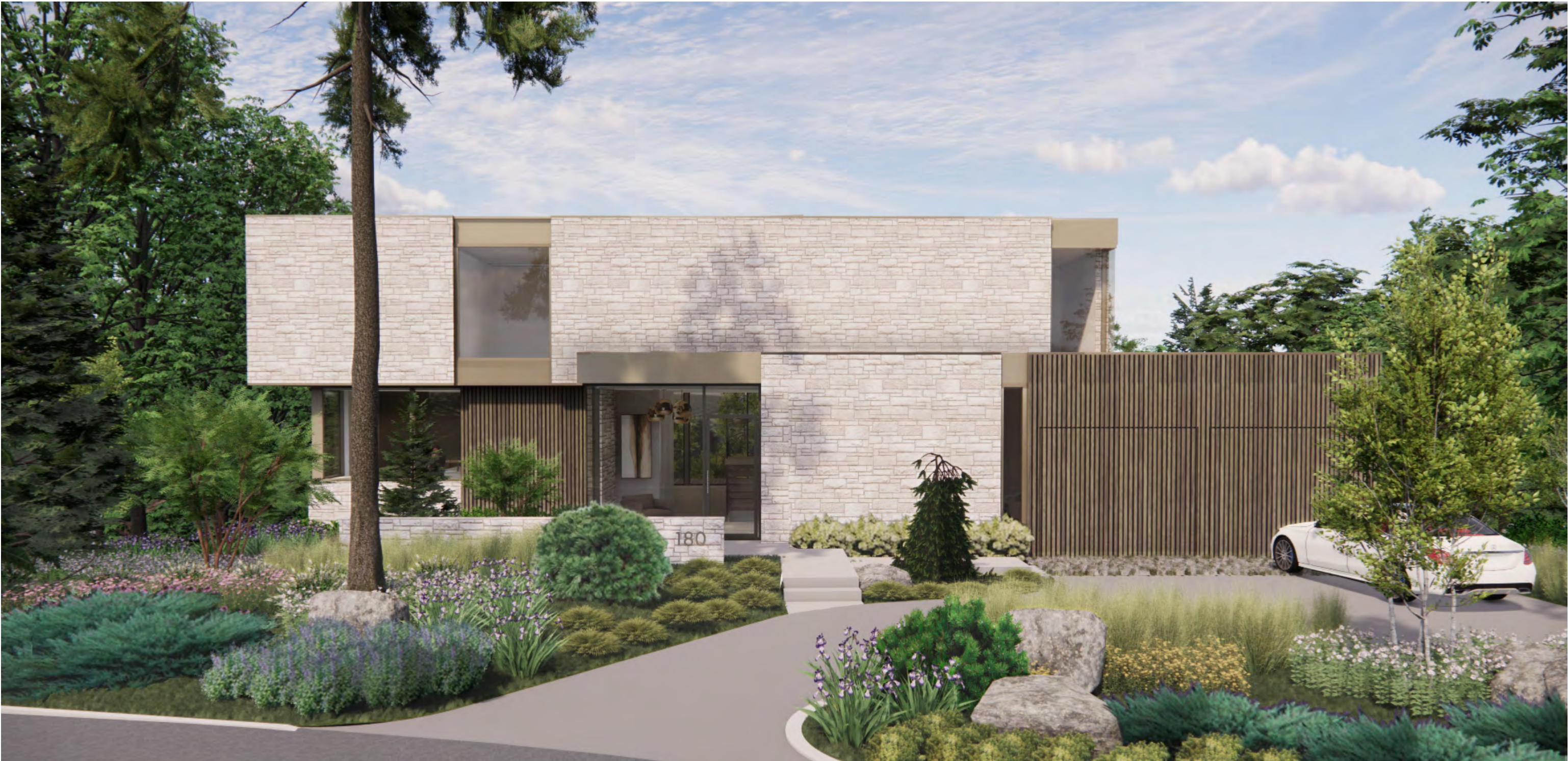
180 Lansdowne Road S - Proposed Design Rendering - From Street