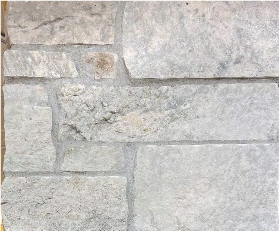
Split Face Limestone