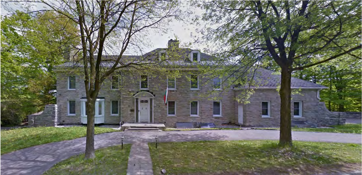
190 Lansdowne Road S - Grade I Heritage Property