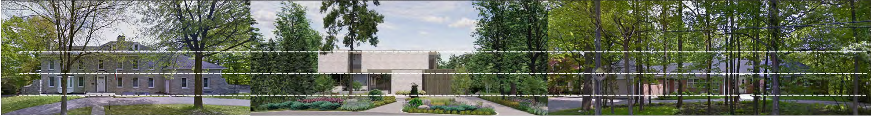
190 Lansdowne Road S