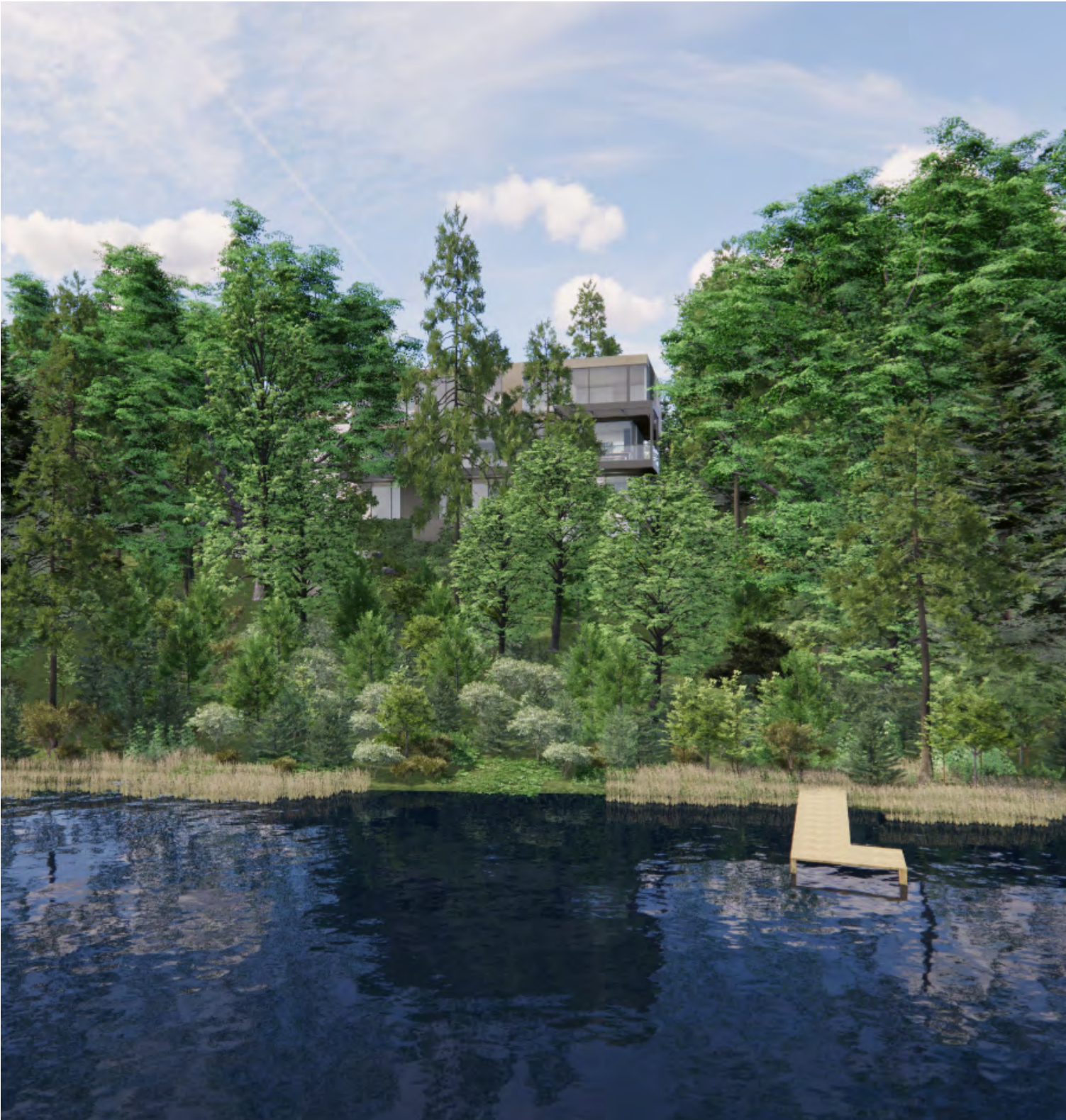
Proposed View - Across Lake