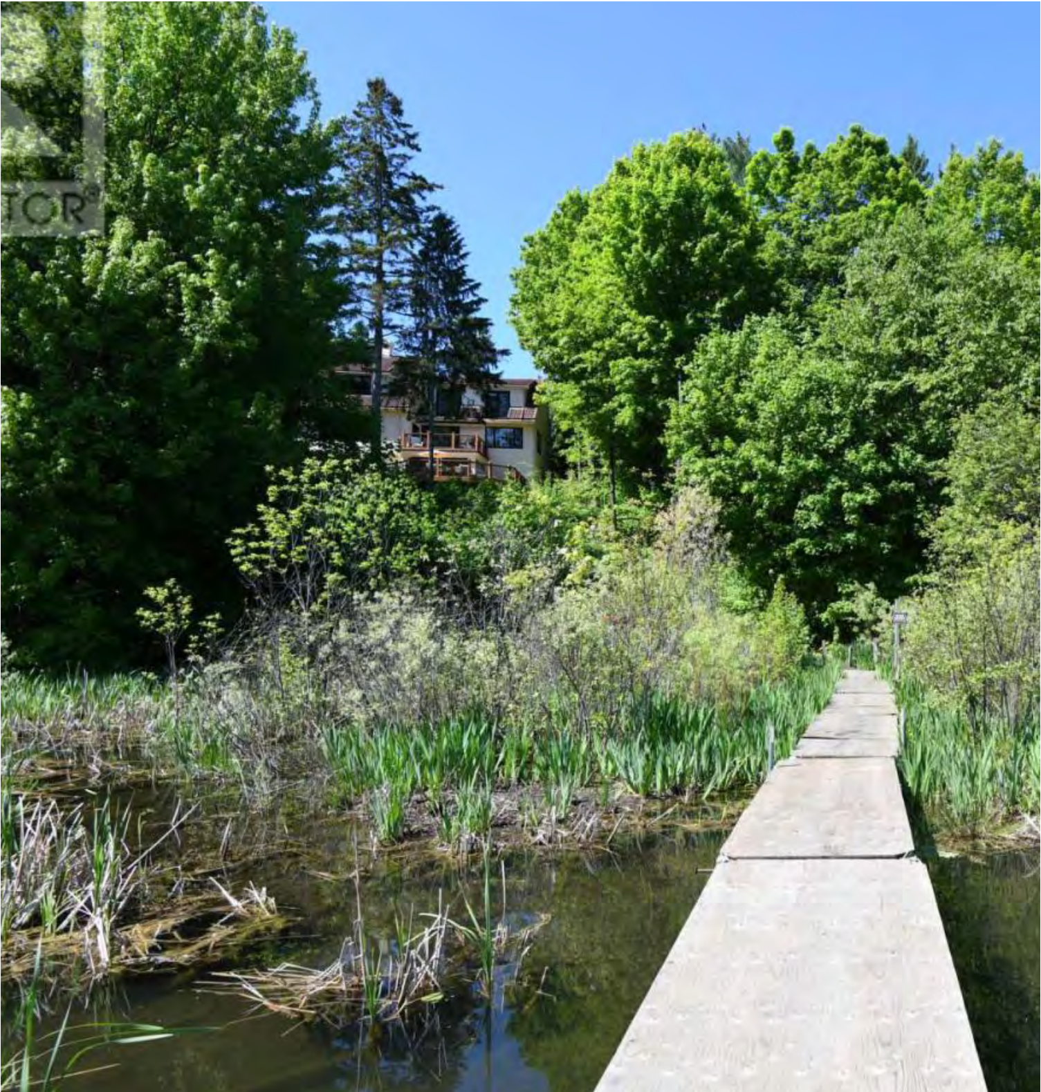
Existing View - From Dock