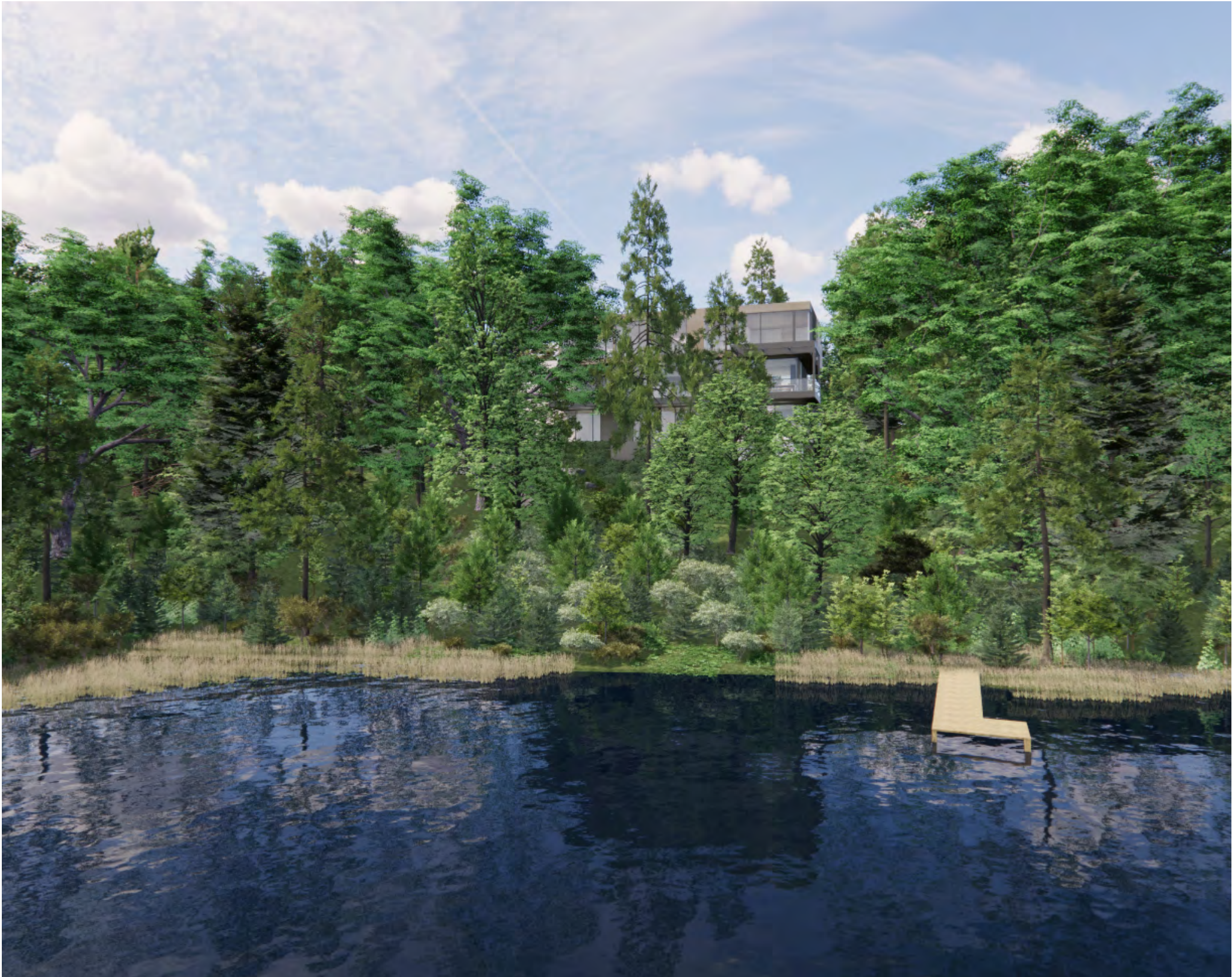
180 Lansdowne Road S - Proposed Design Rendering - Rear From Across Lake