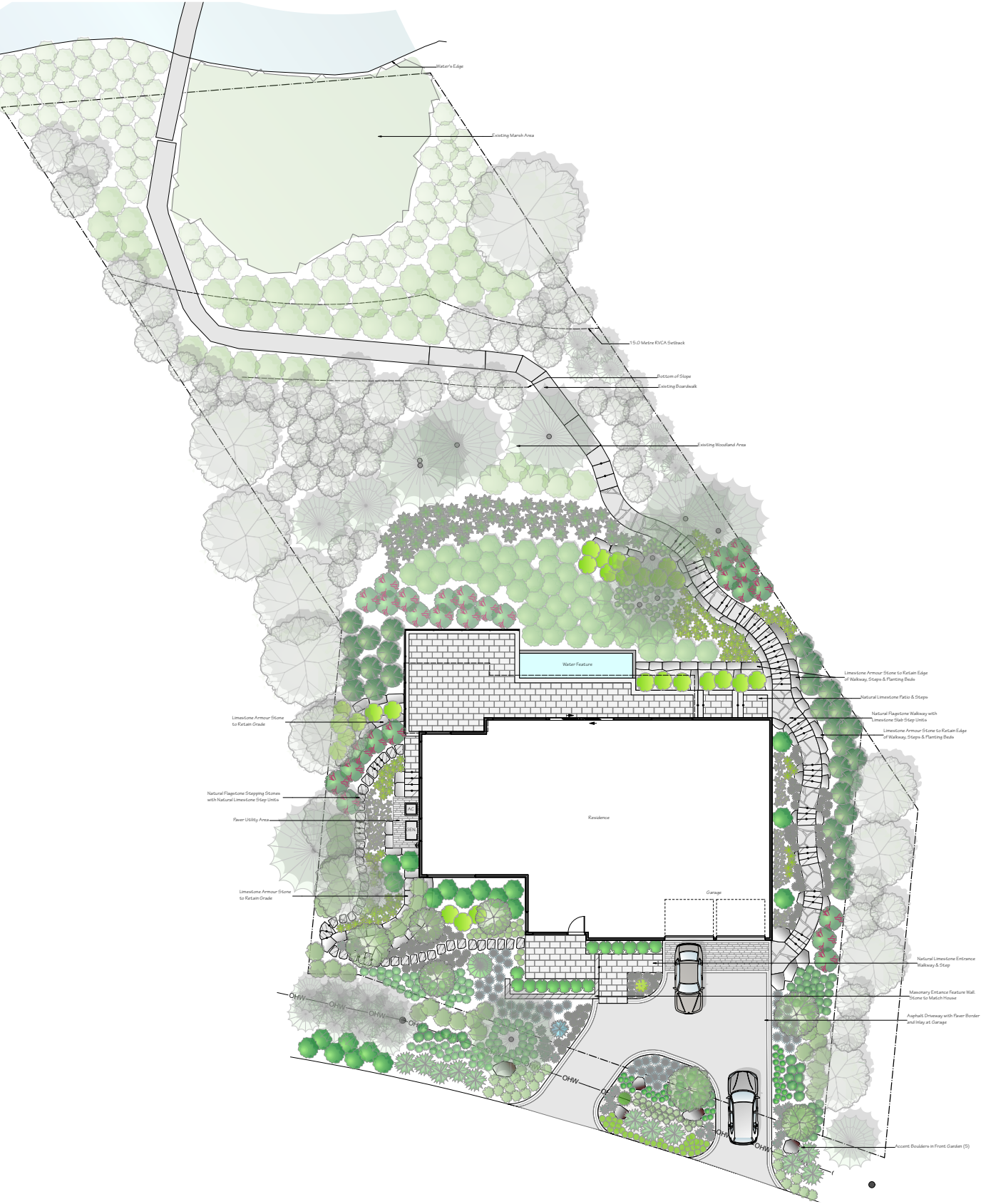
Property Landscape Retention of Existing in Combination with New Plantings