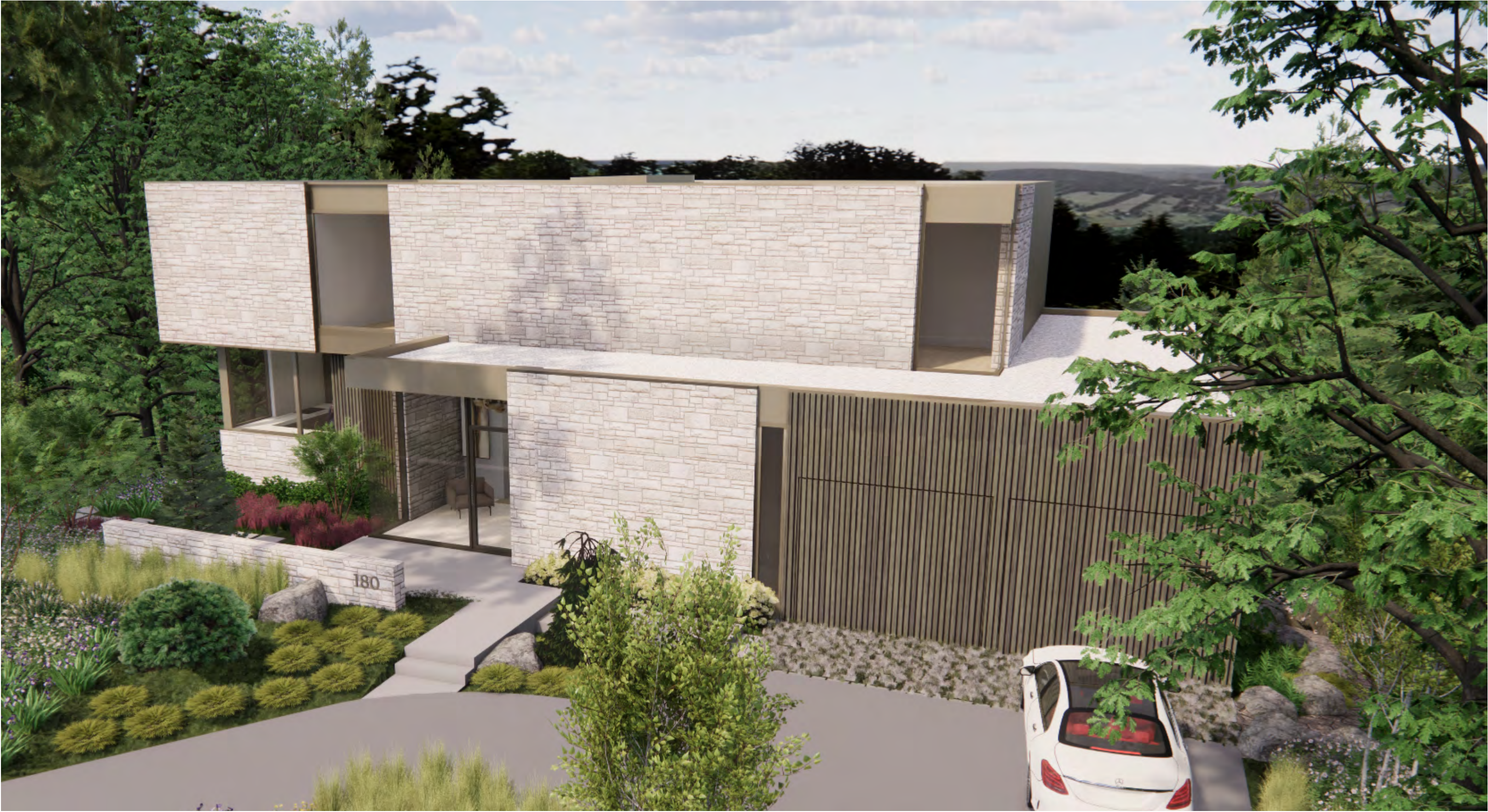
180 Lansdowne Road S - Proposed Design Rendering - Front Aerial