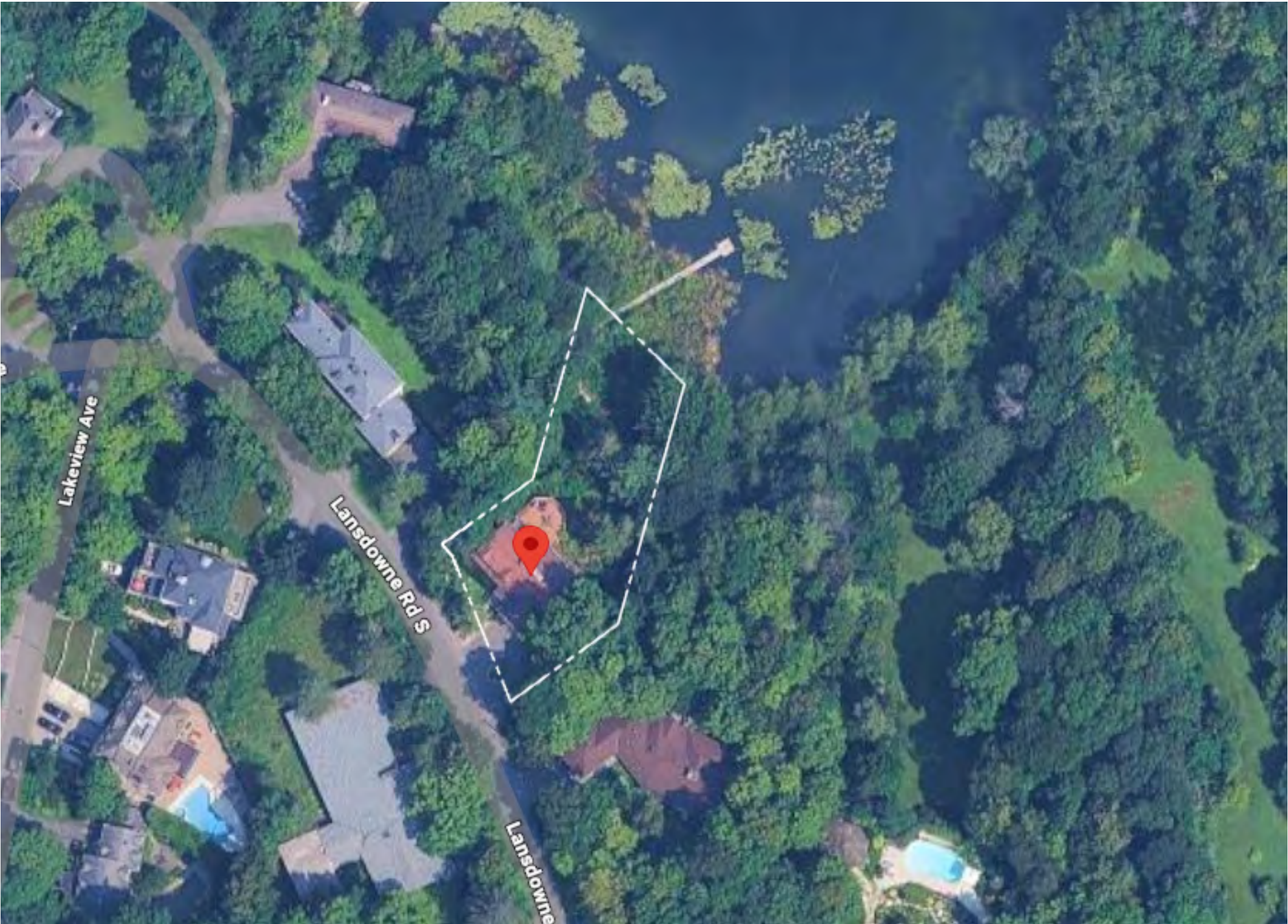
180 Lansdowne Road S Subject Property - Satellite Image