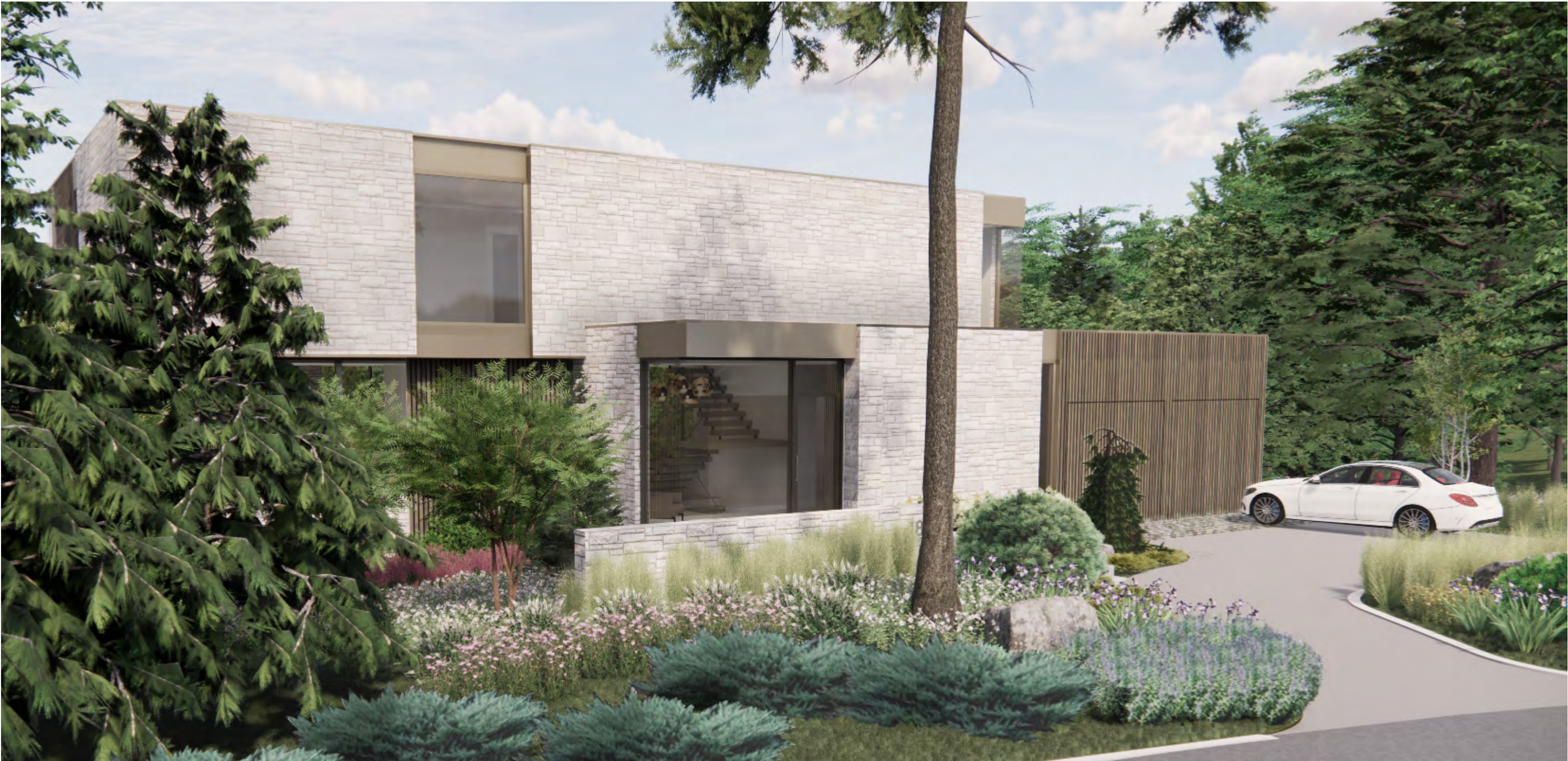
180 Lansdowne Road S - Proposed Design Rendering - From Street