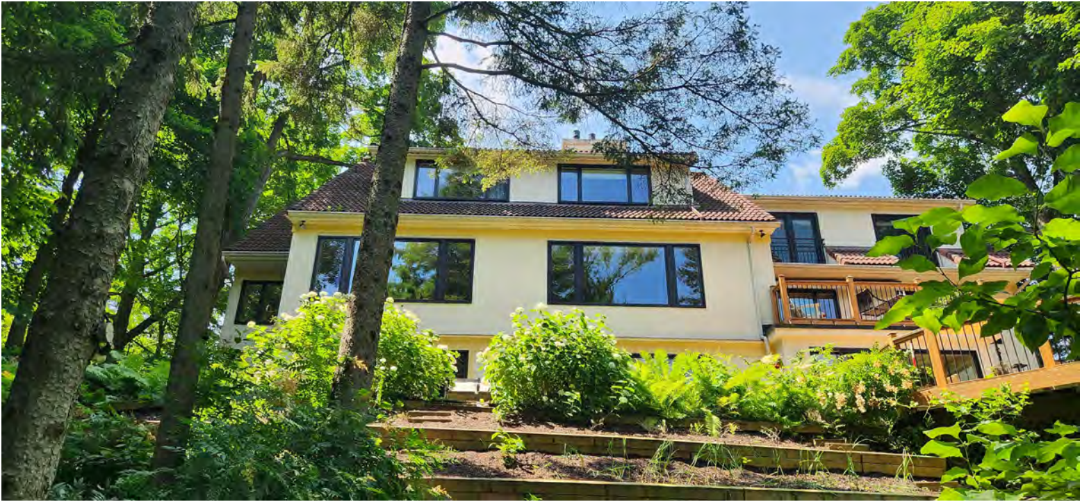
180 Lansdowne Road S Subject Property - Existing Condition