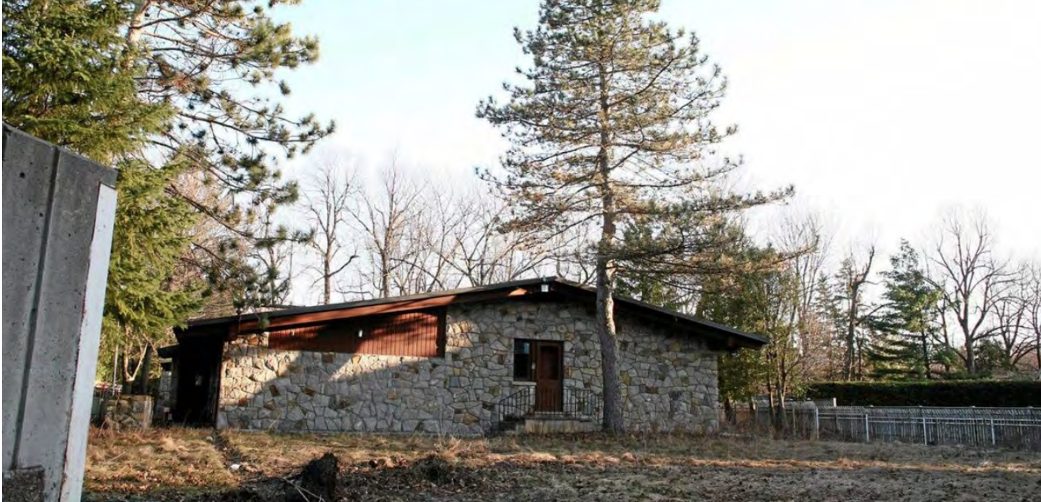
187 Lansdowne Road S - Grade I Heritage Property